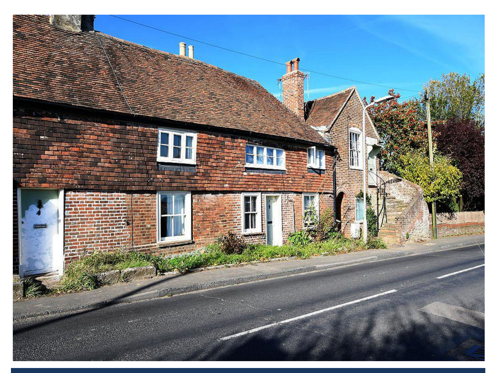
£1300 pcm Holding deposit equivalent to 1 week's rent on application